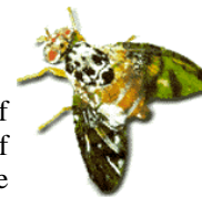
Mediterranean Fruit Fly

Surveys for discovery of incipient infestations of pests which may have eluded our exclusion efforts.